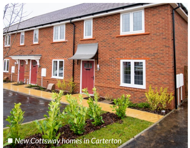
■ New Cottsway homes in Carterton