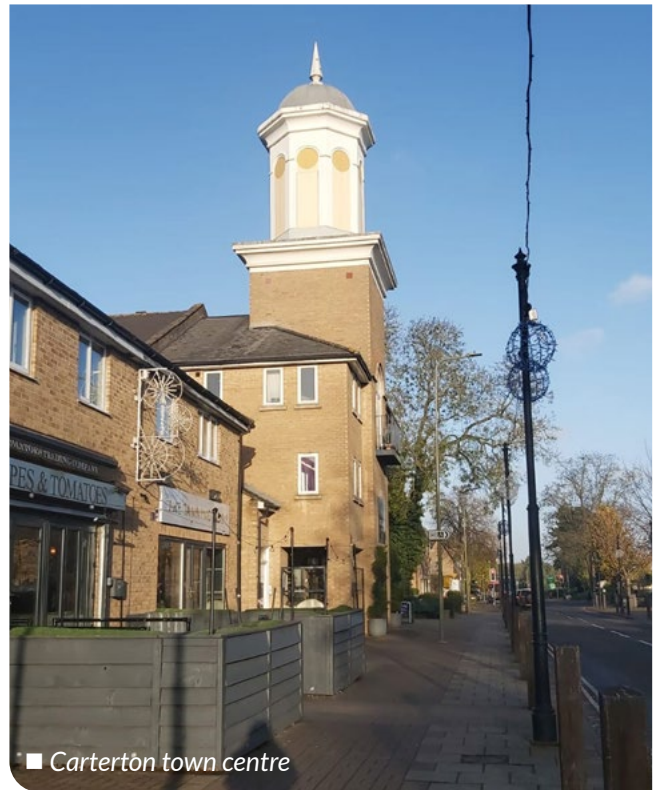
■ Carterton town centre