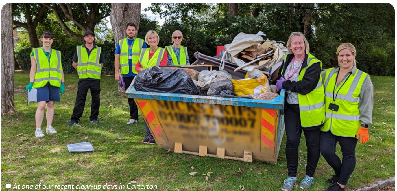
■ At one of our recent clear-up days in Carterton

We have passed all comments received in the survey about the park and play areas to the Town Council, and comments regarding healthcare and dentistry onto local health care providers, all anonymised of course.