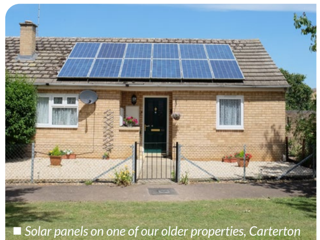
■ Solar panels on one of our older properties, Carterton

The weekly Carterton Market takes place outside the Town Hall and currently operates every Thursday offering a wide variety of stalls. Since 2017, the Lloyds Bank mobile banking unit has attended the market, following the closure of its Carterton branch.